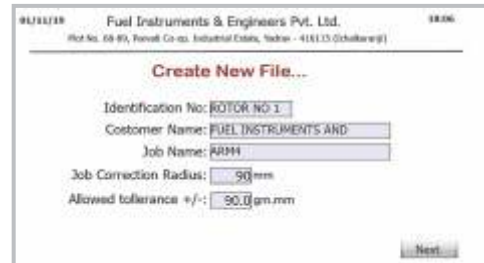
New File Creation