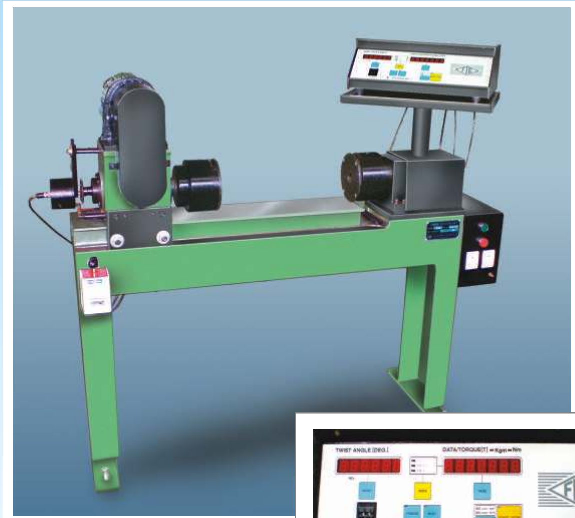
Electronic Control Panel (Series : 9901) :